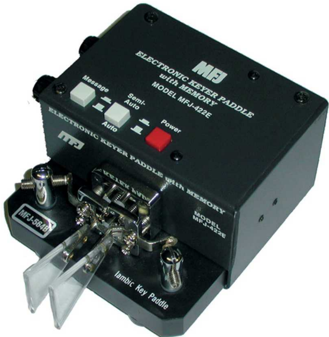
MFJ-422E / 422EX Electronic Keyer Paddle with Memory